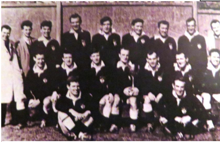
1960-61 Towns Cup Winners