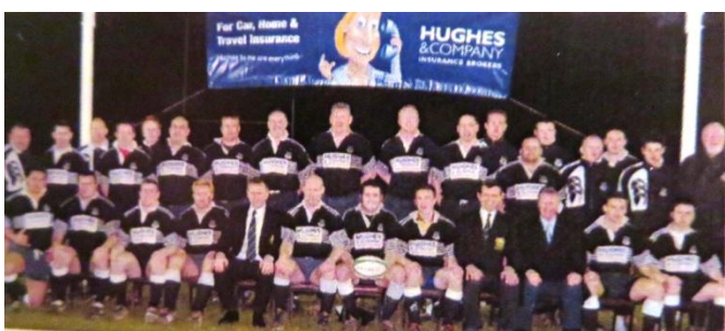
2002-03 - Towns Cup Winners