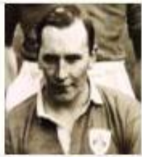
1 - Blair Mayne