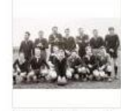
Spirit of Ards Rugby