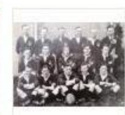
1930 - 31 1st XV