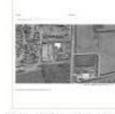
Map of Hamilton Park