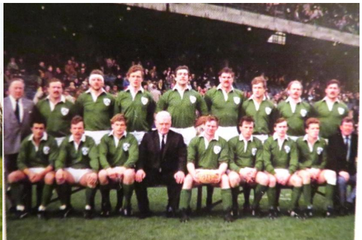
1984 - 85 Ireland Triple Crown