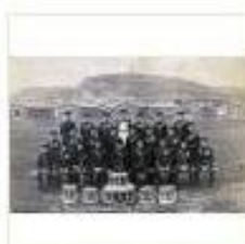
Camp Depot Grounds Police Photo