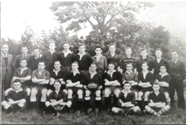
1945-46 1 st XV