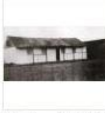
Old Hut and Adjoining Tea Room