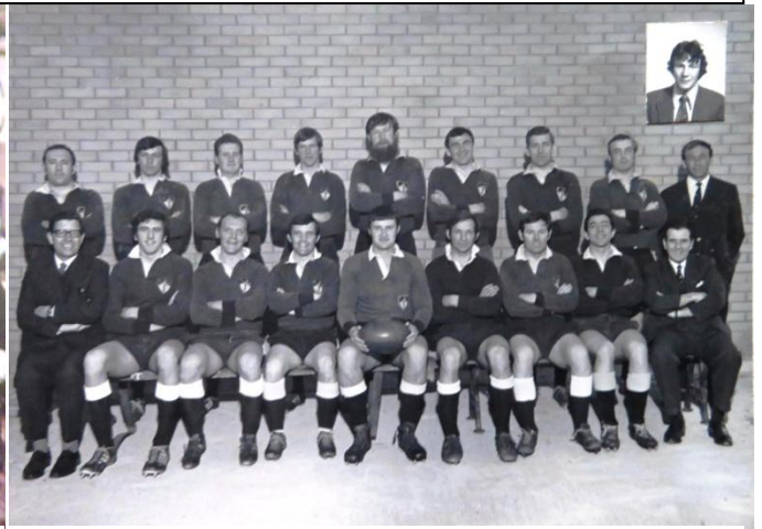
1970-71 1 st XV