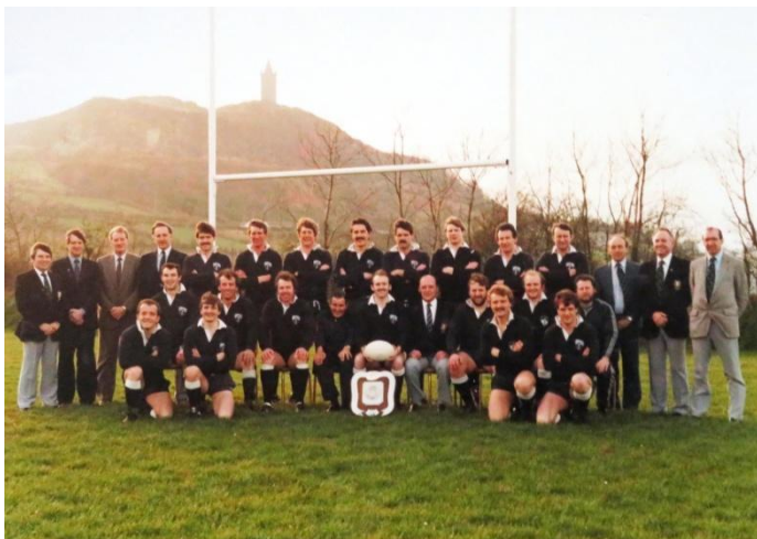
1983 - 84 Winners of Senior League