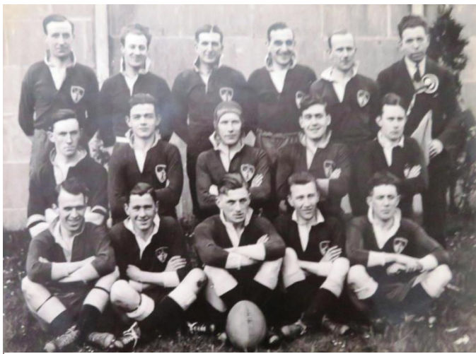
1930-31 1 st XV